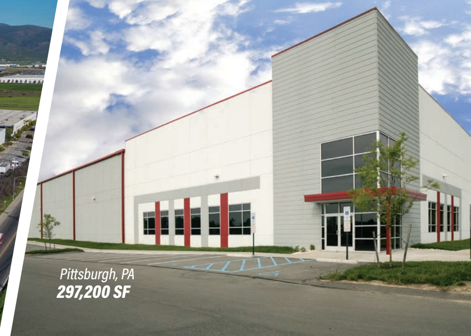
Pittsburgh, PA 297,200 SF