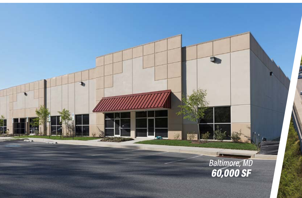
Baltimore, MD 60,000 SF