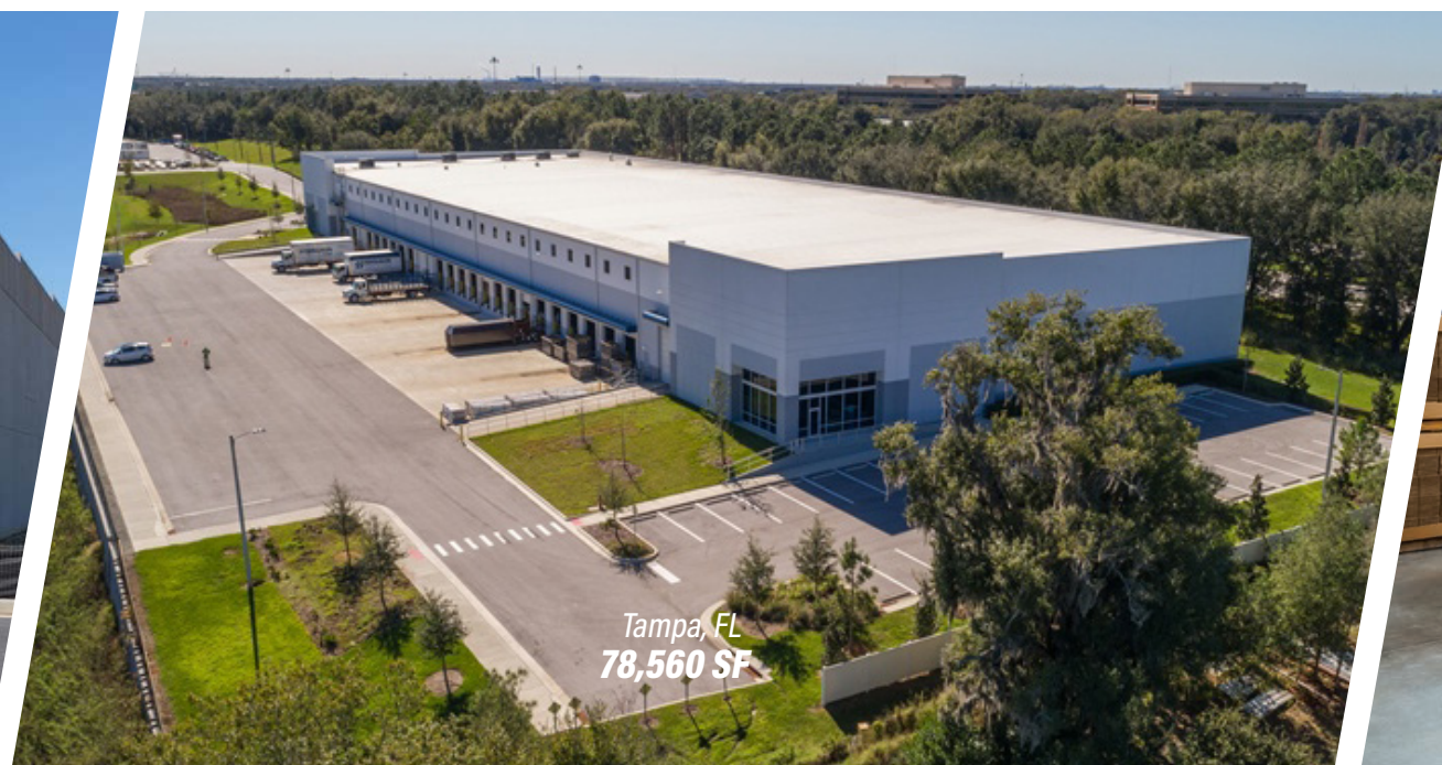
Tampa, FL 78,560 SF