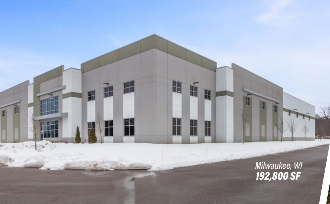
Milwaukee, WI 192,800 SF