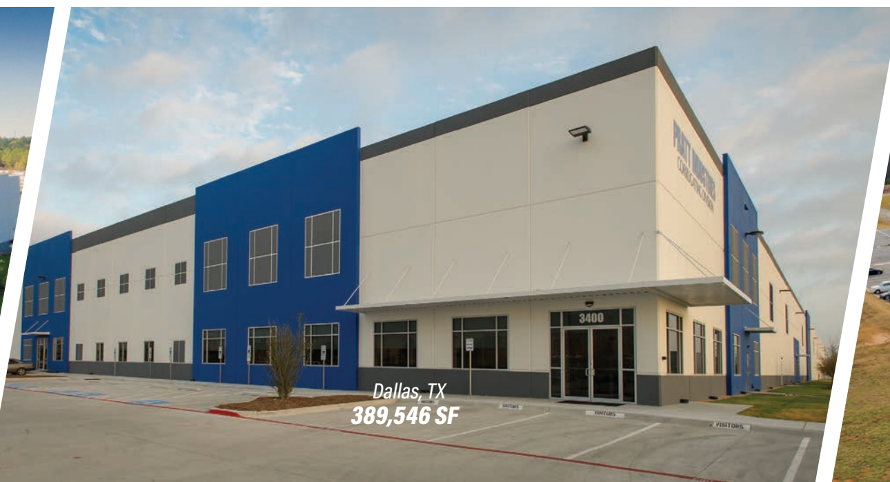
Dallas, TX 389,546 SF