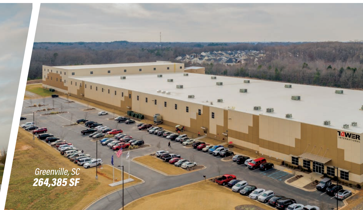
Greenville, SC 264,385 SF