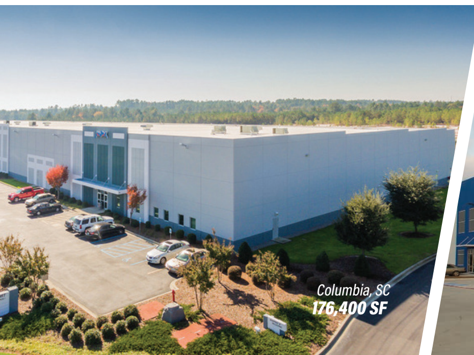
Columbia, SC 176,400 SF