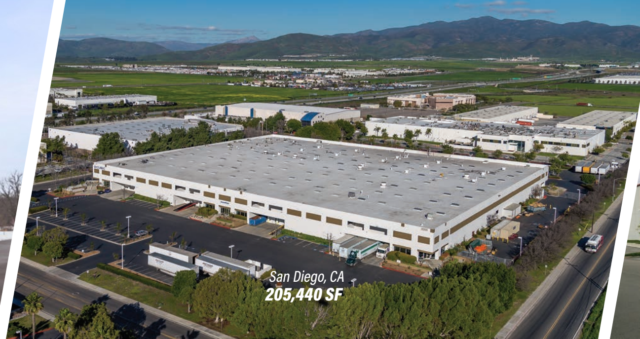
San Diego, CA 205,440 SF